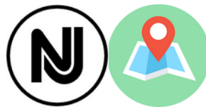
NJ TRANSIT DepartureVision (Real time Departure Vision also available on the App).