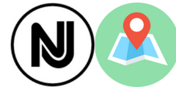
NJ TRANSIT DepartureVision (Real time Departure Vision also available on the App)