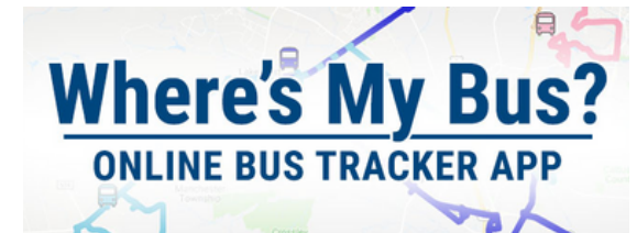
Ocean Ride "Where's My Bus?" Tracker