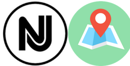
NJ TRANSIT DepartureVision (Real time Departure Vision also available on the App).