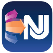
NJ TRANSIT Mobile App