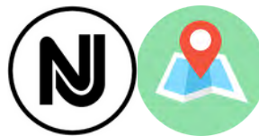
NJ TRANSIT DepartureVision (Real time Departure Vision also available on the App).